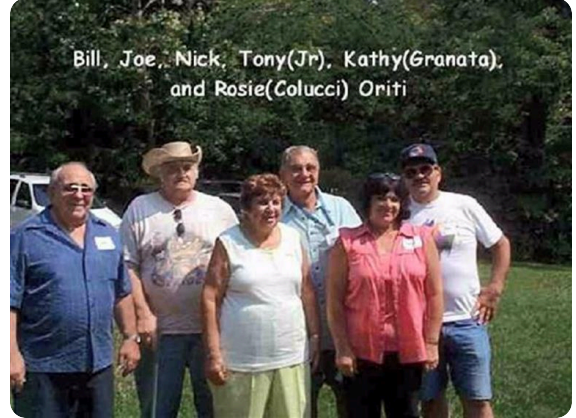
2008 Oriti Family Reunion